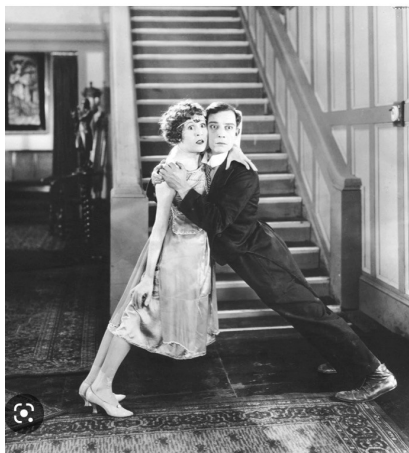
Silent Film Series: Buster Keaton - A short Film...

Hospitality You can sign up to bring snacks for hospitality. Please also take any leftovers home with you!